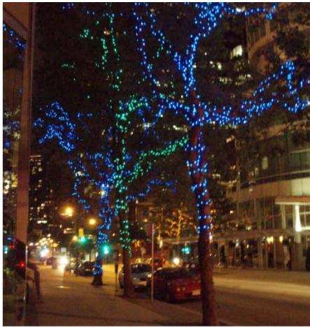
Exhibit 15.1 - Lighting Character