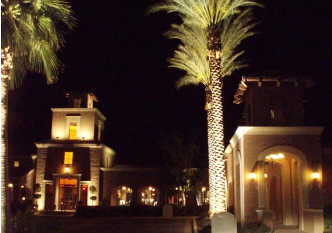
Exhibit 15.2 - Lighting Character