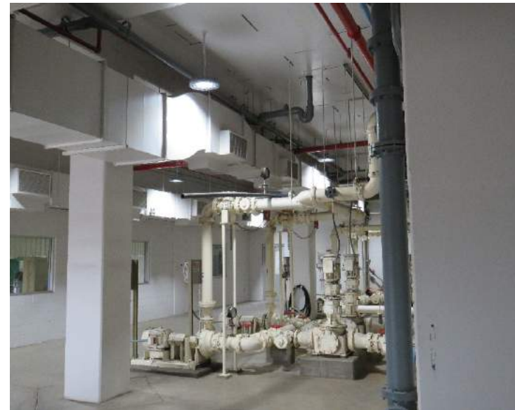
Lighting levels after LED conversion