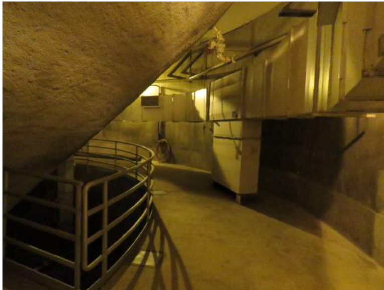
Lighting levels before LED conversion

➤ $369,900 savings in 2016 (4,623,099kWh)