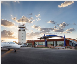
Falcon Field Airport