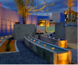
Arts and Culture