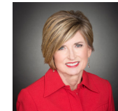
Jenn Duff Councilmember, District 4