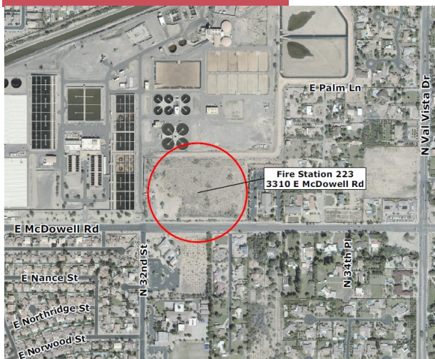
Fire Station 223