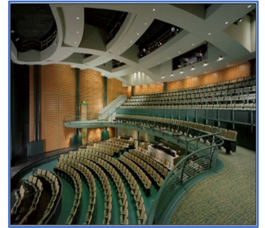
Arts and Culture